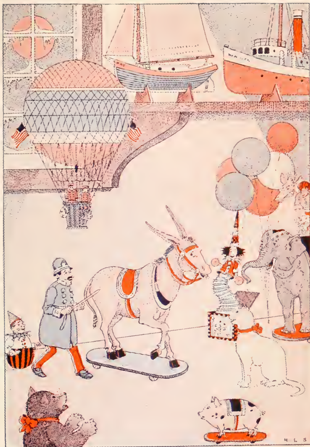
The Nodding Donkey is Ticked by the Toy Policeman.